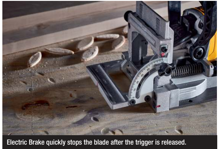
Electric Brake quickly stops the blade after the trigger is released.

RETRACTABLE ANTI-SLIP PINS Helps hold material in place