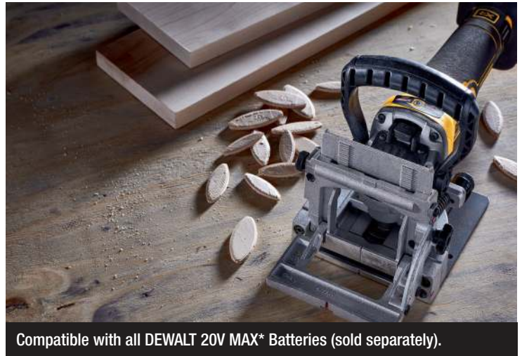
Compatible with all DEWALT 20V MAX* Batteries (sold separately).